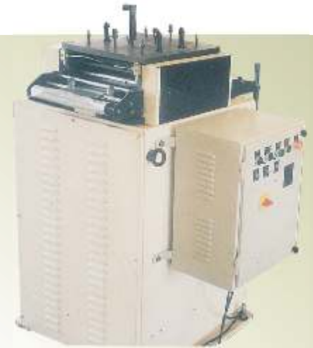
300 (w) x 0.35-1.5 Precision Straightener