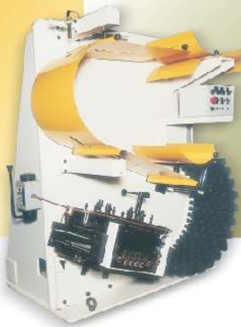
300 (w) x 0.3-1.0mm S loop Precision straightener for high speed stamping presses