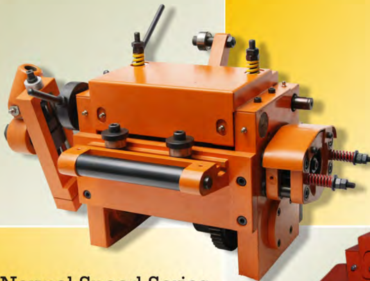
Normal Speed Series JSM - 100

High Quality Product for Coil-Feeding in Press-Room